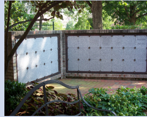
First Church's Columbarium

Either the cremation or the burial of bodily remains in a casket is appropriate. There is no scriptural reason to prefer burial to cremation.