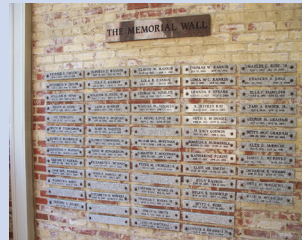
First Church's Memorial Wall