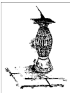
Sundial on West Lawn