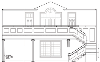
Eller Hall interior, looking south