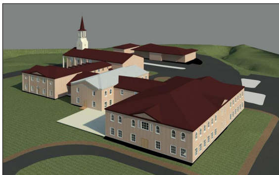
Artist's rendering of the church and education building