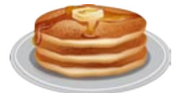
Breakfast: Sausage, eggs, pancakes