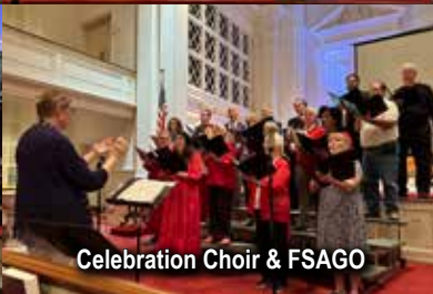
Celebration Choir & FSAGO

On behalf of Kingdom Youth, I would like to thank everyone who participated in FPC's first youth car wash! Whether you drove your youth there, brought your vehicle to be cleaned, or made a donation, its success would have been impossible without YOU. Every donation will go toward our mission trip this summer. Your support of our youth is invaluable and greatly appreciated!