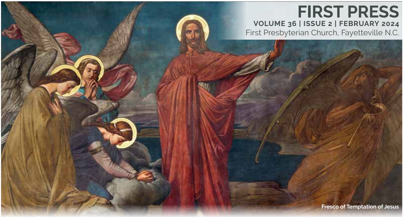
Fresco of Temptation of Jesus